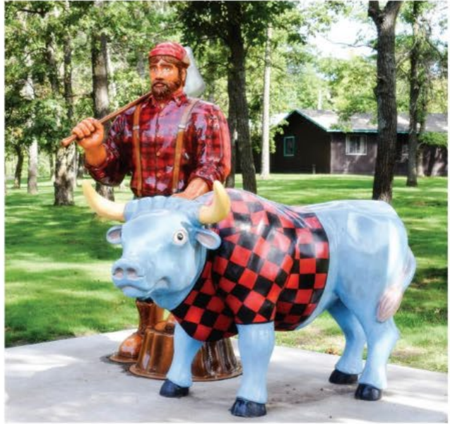
Statues of Paul Bunyan and Babe the Blue Ox keep watch near an entrance to Cragun's Resort, Golf & Conference in Brainerd, Minn. The Midwestern resort opened in 1940.