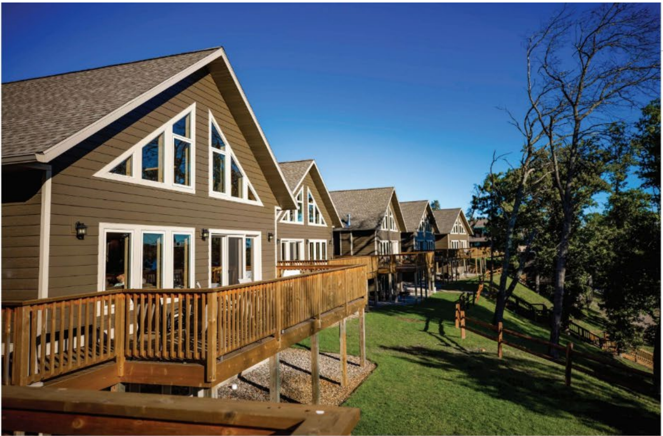
Multiple forms of lodging are available to guests staying at Cragun's Resort, Golf & Conference in Brainerd, Minn., including these Bayview Villas.