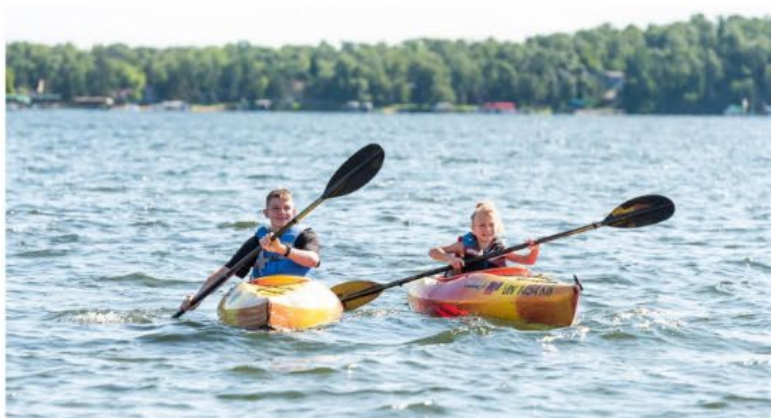
Fishing and kayaking are among the many water-based pursuits that can be enjoyed on Gull Lake at Cragun's Resort, Golf & Conference in Brainerd, Minn. Other activities include boating, cruises, waterskiing, tubing, and banana boat rides.