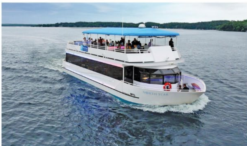
The 65-foot North Star Luxury Yacht offers cruises on Gull Lake at Cragun's Resort, Golf & Conference. A glass-enclosed main deck provides seating for 62 riders, while the upper deck patio offers space for 36 passengers.

Visitors can step aboard the North Star Luxury Yacht for a pleasant cruise on Gull Lake. One highlight is a BBQ voyage where guests can enjoy a barbecue rib dinner while watching the sun go down over the water.